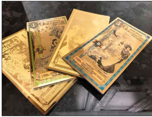
Utahns can now buy "Goldbacks," actual spendable gold offered by Salt Lake City-based GoldATM, at machines around the Wasatch Front.

GoldATM.com is a privately held Utah corporation.