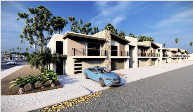
SET TO BE COMPLETED SUMMER 2024

LOCATED IN HURRICANE, UT-NEXT TO SAND HOLLOW