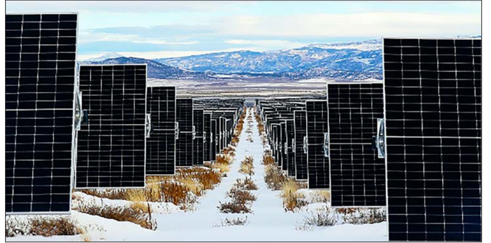
Greenbacker Capital Management of New York City has announced that its Appaloosa Solar power plant in Iron County has entered into commercial operation.

More than 1,800 other American Red Cross workers across the U.S. are represented by the Teamsters.