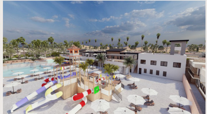
CONTACT BRADEN AT TEAM PLUS REALTY FOR MORE DETAILS