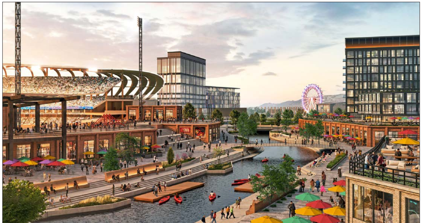
A concept drawing recently released by the Larry H. Miller Co. imagines how a part of the planned Power District development in the northwest part of Salt Lake City might look. Included are a revitalization of the Jordan River into a Riverwalk feature with dining and entertainments and a big league ballpark (left).

The Larry H. Miller Co. and the Miller family recently unveiled renderings and videos of plans for the development of the Power District in the northwest part of Salt Lake City.