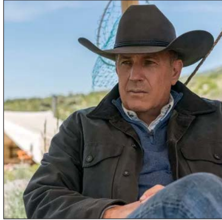
Actor/director Kevin Costner, shown here on the set of the blockbuster TV series "Yellowstone," has announced plans to open a major movie studio in St. George.

The movie studio will be built along the Southern Parkway that wraps around