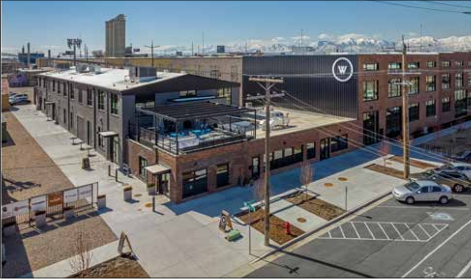
An artist rendering depicts a 30,000-square-foot incubator planned by Portal Innovation at Woodbine Labs in Salt Lake City. Science-based startups will be the focus of the facility.