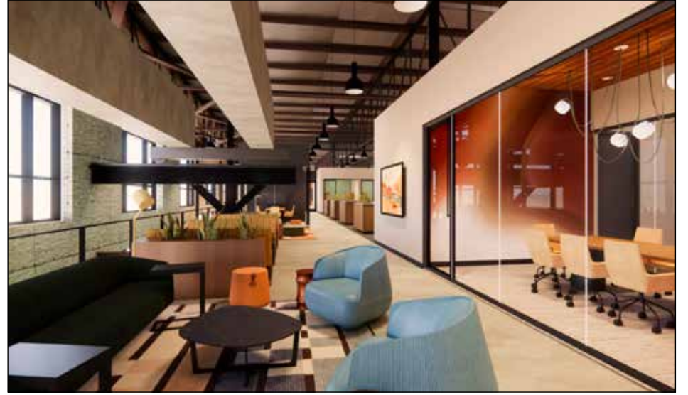
An artist rendering shows the interior of an incubator planned by Portal Innovation at Woodbine Labs in Salt Lake City. It is expected to be operational by the second quarter of 2027.