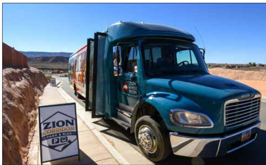
The Washington County town of Virgin, in partnership with Zion White Bison Resort, SunTran and Greater Zion Convention & Tourism Office, has introduced the Zion Corridor Park & Ride to give visitors an alternative place leave their vehicle as new restrictions limit access to Zion National Park roads.

According to organizers of the new option, travelers can park their vehicles at the Zion Corridor Park & Ride lot located at Zion White Bison Resort in Virgin. From there, riders board SunTran or a Zion White Bison shuttle bus at the resort stop for transportation into Springdale at Lion Boulevard. From Springdale, riders can walk or use connecting shuttles to reach Zion Canyon