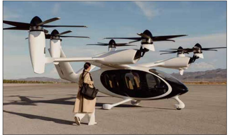
Sky taxis may be helping transport visitors around Utah when the 2034 Olympic Winter Games come to the state.