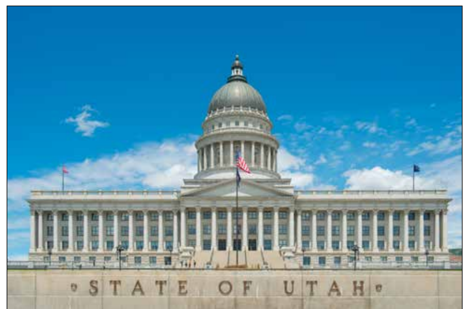
Utah lawmakers finished their 45-day session on March 6, passing over 540 bills.

Data centers over 10,000 square feet in size will be required to annually report to the state their water usage, projected future water use and their efforts to reduce water consumption. The state Division of Water Rights will report nonproprietary information at its public website.