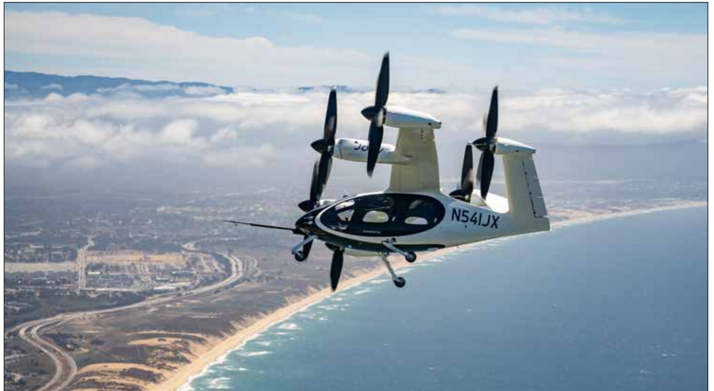
A Joby electric aircraft flies over Monterey Bay off the California coast. The goal is to have air taxis in place for the 2034 Winter Olympics in Utah to get visitors to and from venues.