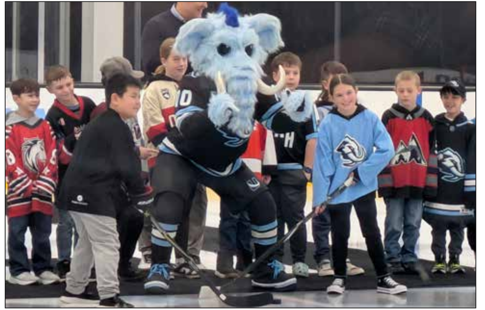
Team mascot Tusky dropped the puck for a group of young hockey players who were among the first visitors to the new facility.