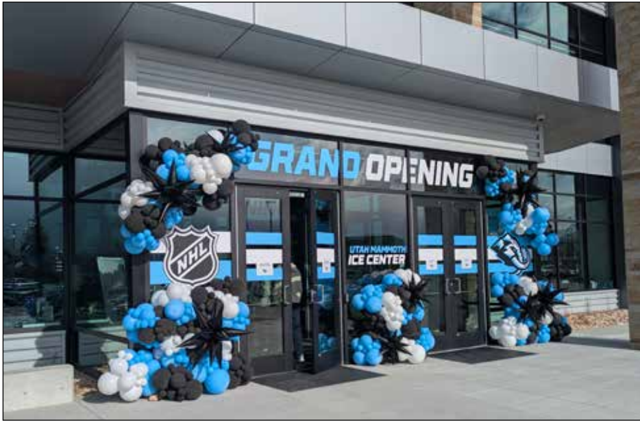
The Utah Mammoth Ice Center celebrated its grand opening during a three-day celebration Feb. 20-22.