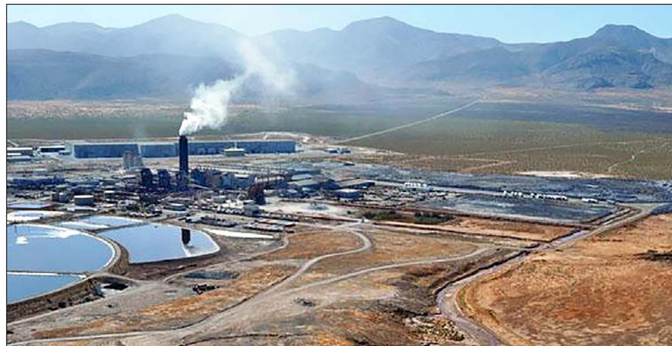
US Magnesium's Rowley operations in Tooele County are under fire as Gov. Spencer Cox looks to include it in an ozone nonattainment area as a way to improve Wasatch Front air quality. The plant also is seen as a producer of halogen emissions that impact air pollution, and recent legislative action calls for a study of halogen emission sources.