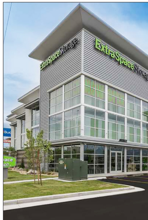
Extra Space Storage Inc. of Salt Lake City has acquired New York-based Life Storage, increasing its store count by more than 50 percent to over 3,500 locations. Shown is the company's self-storage facility in Murray.