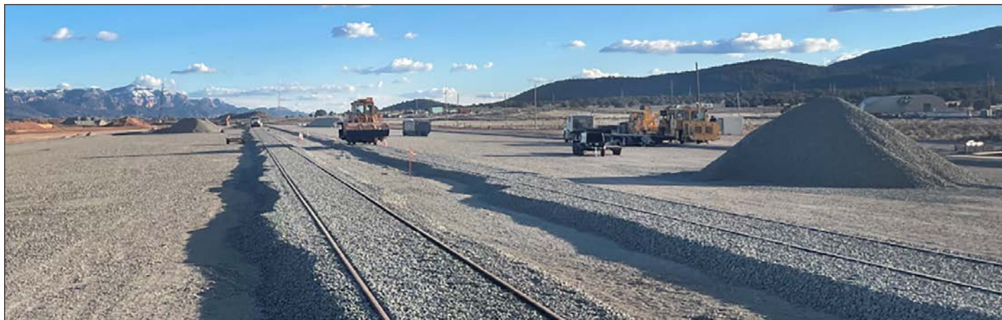
Construction work wraps up on the Savage Cedar City transload facility in Iron County. The site is now in operation as part of the Utah Inland Port.