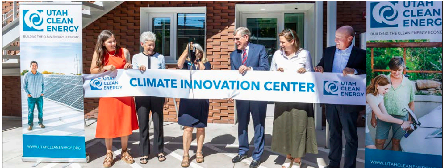
Utah Clean Energy officials and dignitaries cut the ribbon for a renovated building aimed at being an example of a zero-energy structure whose energy efficiency can be replicated in homes and other buildings across the West. The Climate Innovation Center in Salt Lake City also will be home of the nonprofit organization.

New clean energy facility aims to 'lead by example'