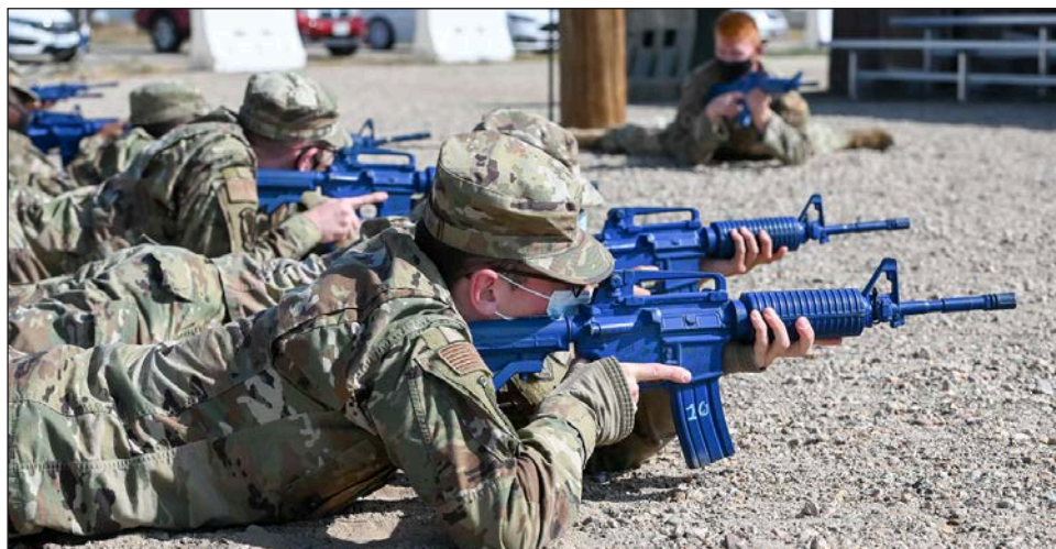
Airmen from Utah's Hill Air Force Base participate in recent training exercises. When their military obligation is over, veterans will have plenty of available help if they want to start their own businesses, according to speakers at a recent Veteran Owned Business Partnership Conference in Sandy.