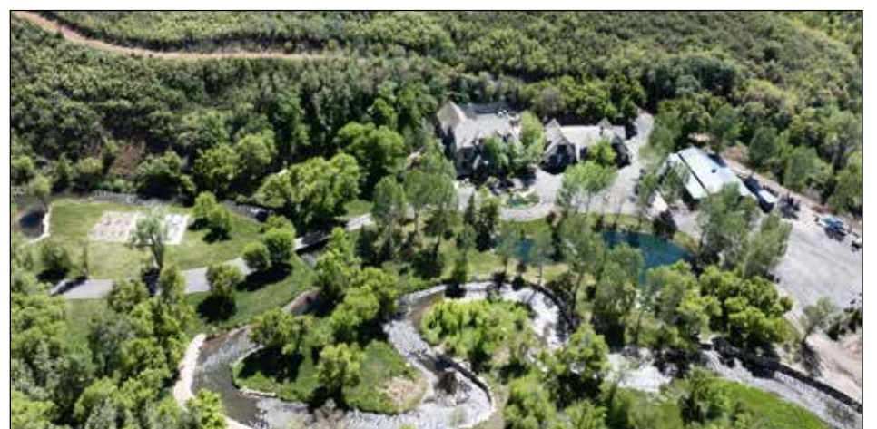
Likely to become Utah's highest-priced residential property sale at $72.5 million, the Sheep Creek Canyon Ranch near Morgan has a 6,000-square-foot home, a three-bedroom guest house and more than four miles of stream frontage.

In the second quarter of 2024, only Huntsville and Eden had median home prices above $1 million. Today, Alpine tops the luxury market at $1.218 million, followed by Eden at $1.1 million and Emigration Canyon at $1.083 million. Rounding out the current high-end markets are Holladay ($1.025 million), the Avenues ($1.005 million) and Draper ($1 million). Huntsville, meanwhile,