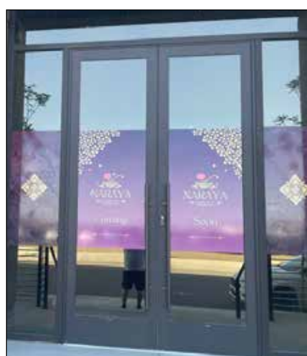
Naraya deluxe Thai food is coming this winter to Downtown Daybreak.

The award-winning Nomad eatery is coming this fall. It first opened in 2017 and focuses on globally inspired cuisine. This restaurant combines fresh, locally sourced ingredients with innovative flavors to create unforgettable dishes. They provide a rotating menu that reflects available local produce. The Nomad restaurant actively participates in local events and collaborates with nearby farms. Their chefs bring a wealth of experience from various culinary backgrounds.