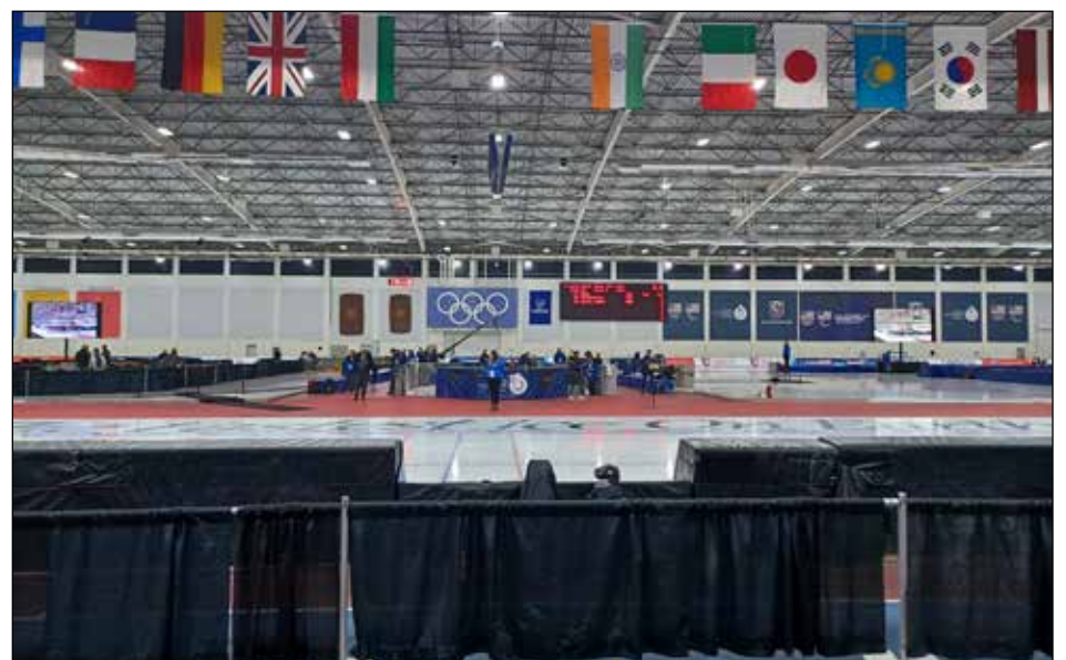
The Utah Olympic Oval in Kearns will again be a host site for the Olympic Winter Games when they return in 2034.