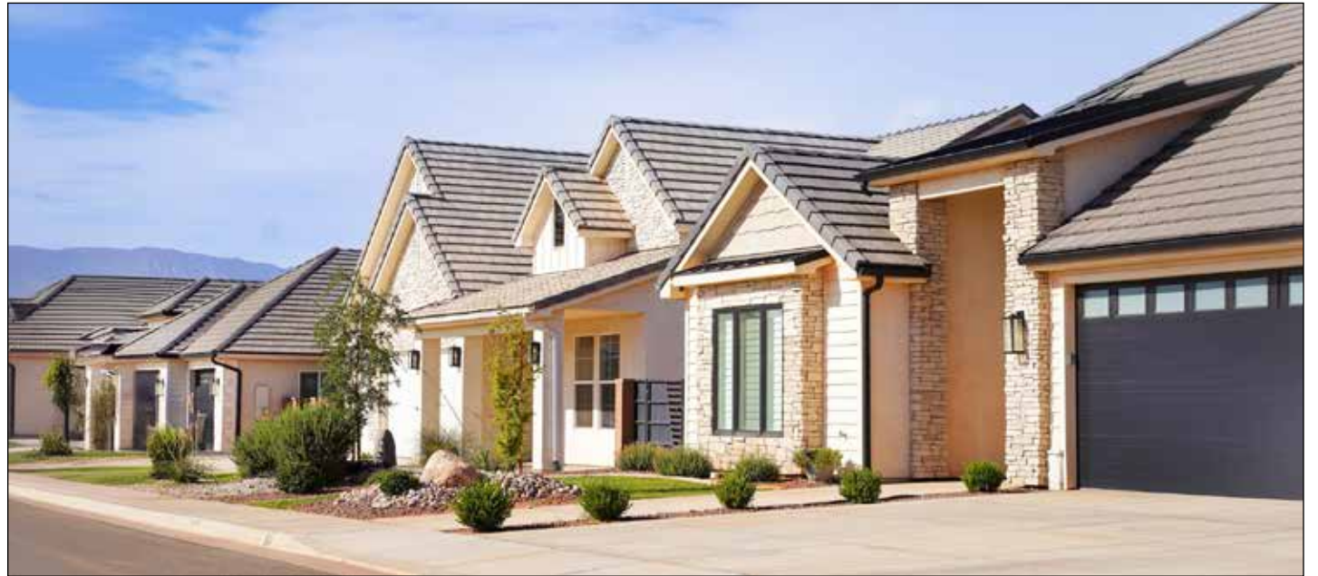
A new report from the Kem C. Gardner Policy Institute at the University of Utah finds that, although home prices are stable, Utah has the ninth-most-expensive housing market in the U.S.